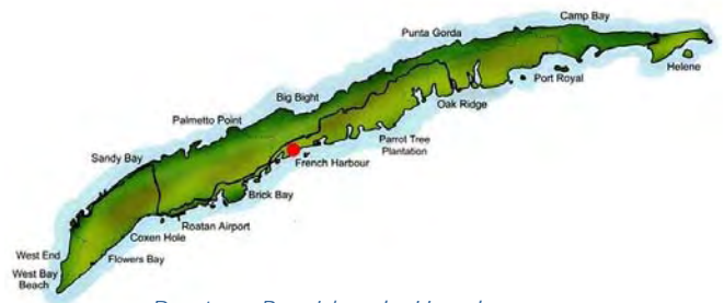
Roatan, Bay Islands, Honduras