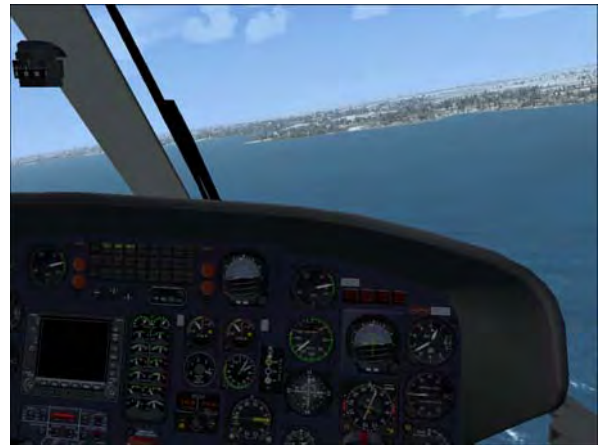
Over the Marysburgh Vortex