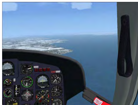
On approach to Kingston