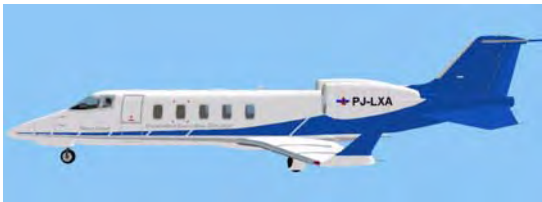
The TBJ - Tradewind BizJetz

It is most likely that we will have to fly some of the VIP's to the concerts, so we will have our two Lear jets on 'stand-by' nearby.