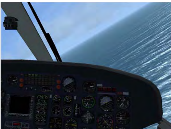
Searching Lake Ontario