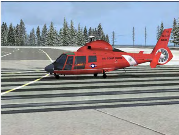
The HH-65 Dolphin