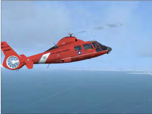
The Dolphin flying a SAR pattern

It was dark when they resumed the search slowly flying a search pattern. The lake water was an eerie ghostly green color when viewed through the night vision goggles.